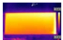
Evenly heated radiators

The SpiroVent RV2 removes the micro-bubbles from the hot water immediately after it leaves the boiler. Further along the system, the water can take up air again and will burst the air bubble. The radiators will then heat up evenly again and the boiler will run as efficiently as possible.