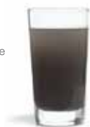
Water contaminated with magnetite

The main cause of contamination is corrosion resulting from the reaction of (the air in) water with the parts of the system containing iron. Contamination in a central heating system consists mainly of harmful magnetite. A clear indication of the presence of magnetite is the installation water turning black. A build-up of magnetite deposits prevents optimal operation of the heating system and leads to excessive damage and breakdowns.