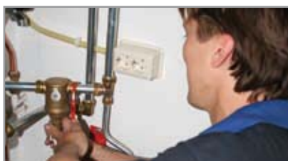
SpiroVent and SpiroTrap fitted as standard in every heating system.

While renovating 160 heating systems, a housing corporation decided to fit 50% of the properties with a SpiroCombi deaerator and dirt separator. Circulation problems arose in 24% of the houses without a SpiroCombi. These problems did not occur in the houses with a SpiroCombi; these convincing figures helped the decision for the housing corporation to fit all the boilers for both new and renovation projects with a SpiroCombi. According to the housing corporation, this product provides real value for money, not only in the short term but also in the long term by protecting the systems.