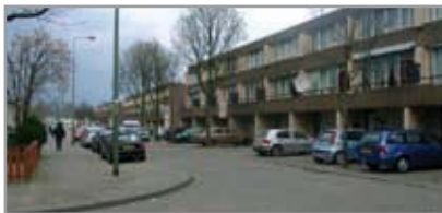
Far fewer complaints and far fewer pump and expansion tank breakdowns.

The use of Spirotech products ensures a higher level of comfort for occupants and users and consequently fewer complaints. The products also protect the system so that it will have a longer life.