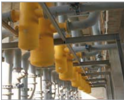
23 SpiroCombis keep the climate conditioning system at Barcelona Airport constantly free of gases and dirt particles.

The use of Spirotech products ensures a higher level of comfort and consequently fewer complaints. The products also protect the system so that it will have a longer life.