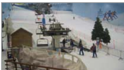
The world's first indoor black run ski slope has been made possible by using Spirotech products.

In an office complex, the heating system services numerous rooms. The typical piping system with many horizontal staggered pipes and the induction ceilings used make the systems difficult to vent. That is why SpiroVent Superior was installed. During the start-up period, over 1000 litres of air was removed from the system. This venting enabled the system to be commissioned extremely quickly.