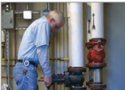
The SpiroVent Superior removed a huge volume of air during the start-up phase, thus enabling very quick commissioning.

A brand new terminal with a total effective area of 525,625 m 2 has been built at the international airport in Barcelona. A great deal of attention was paid to efficiency and sustainability when designing the climate conditioning system. As a result, 23 SpiroCombis were installed which constantly remove the gases and dirt particles present in the system. This has been Spirotech's contribution towards creating a comfortable environment at this Spanish airport.